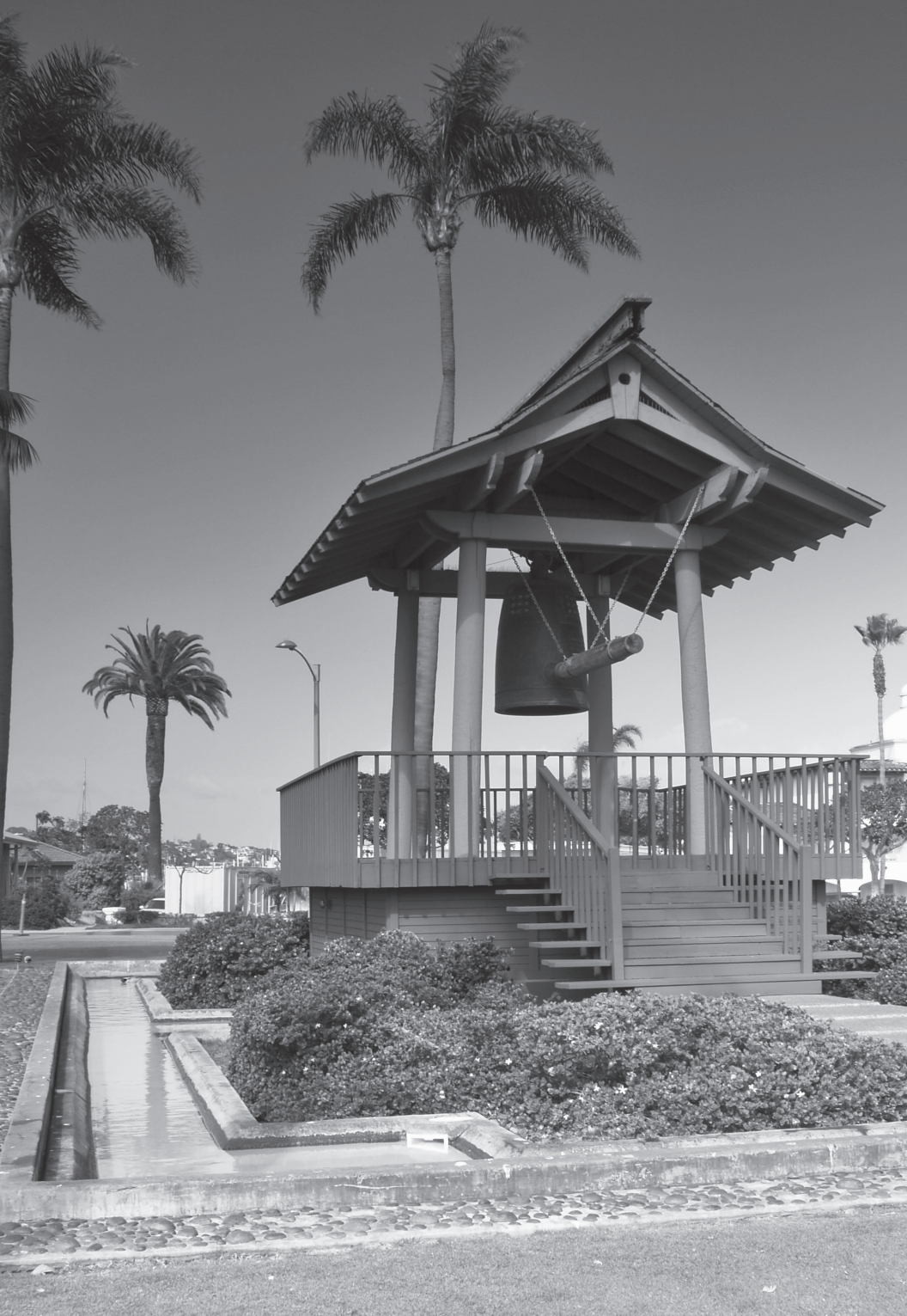
Yokohama Friendship Bell