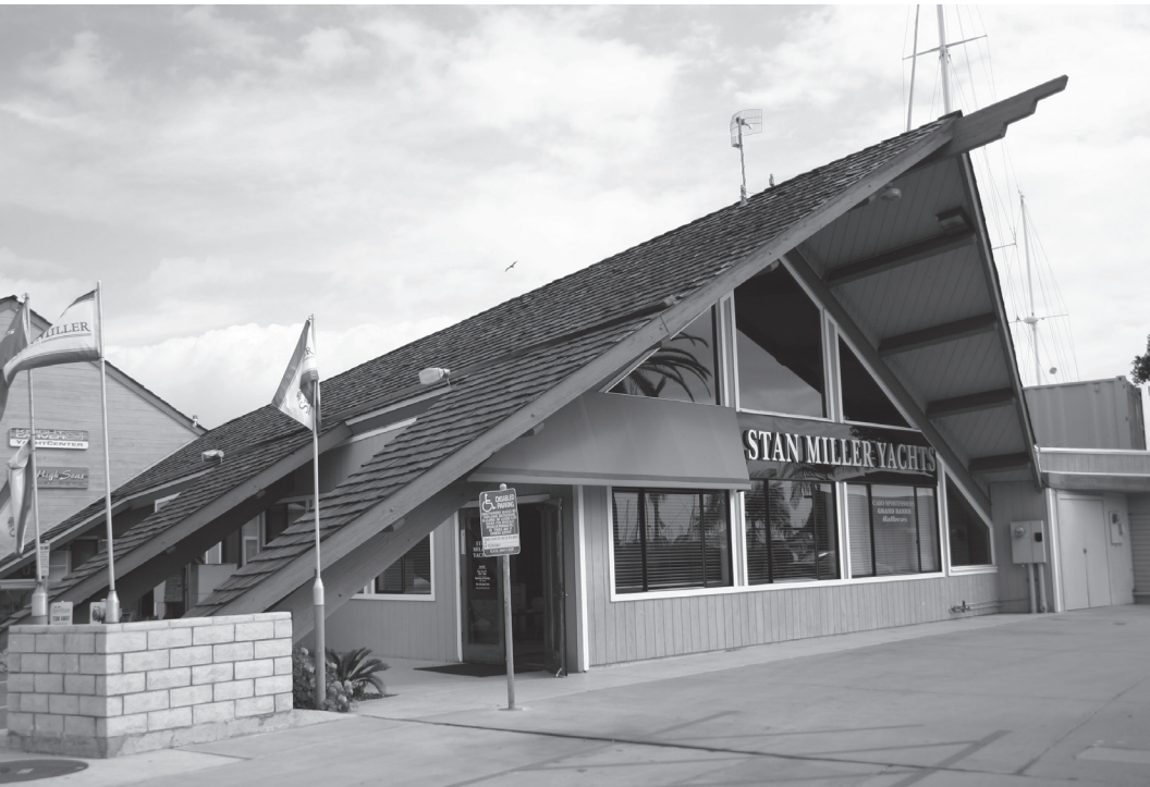
Stan Miller Yachts