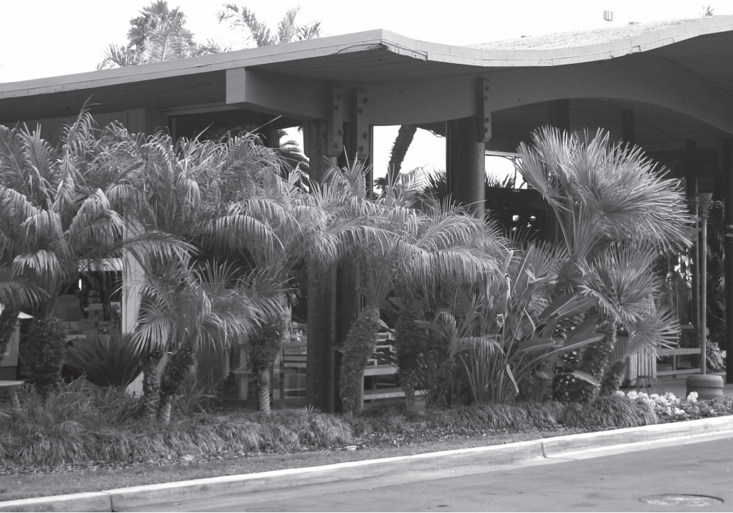
Paradise Point Resort Gift Shop

depicted motion, upswept roofs, curvaceous, geometric shapes, and the bold use of glass, steel and neon.