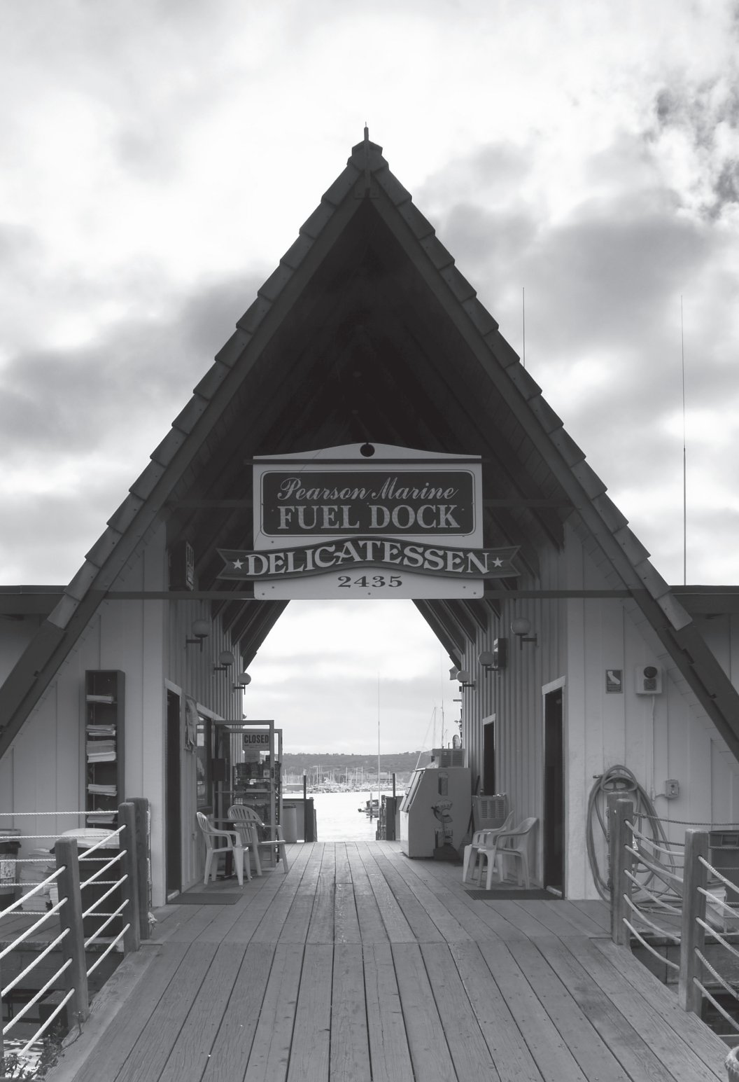
Pearson Marine Fuel Dock