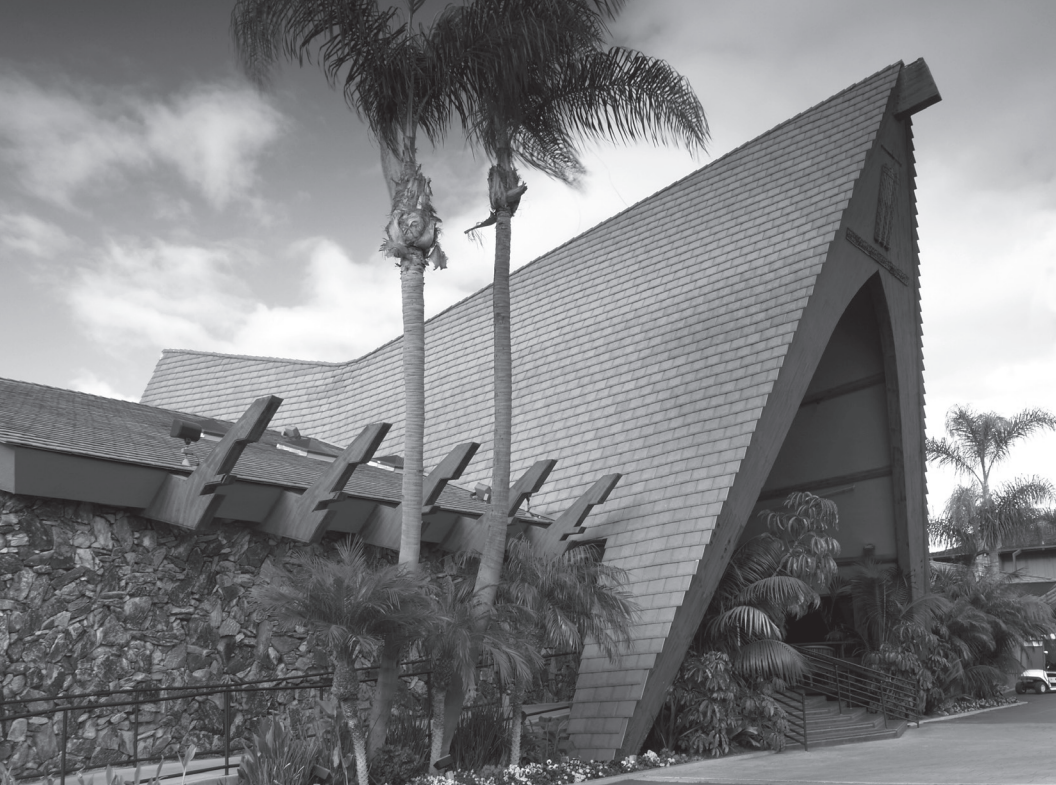
Humphrey's by the Bay Restaurant

Humphrey's Half Moon Inn & Suites , originally named Half Moon Anchorage/Boat-tel