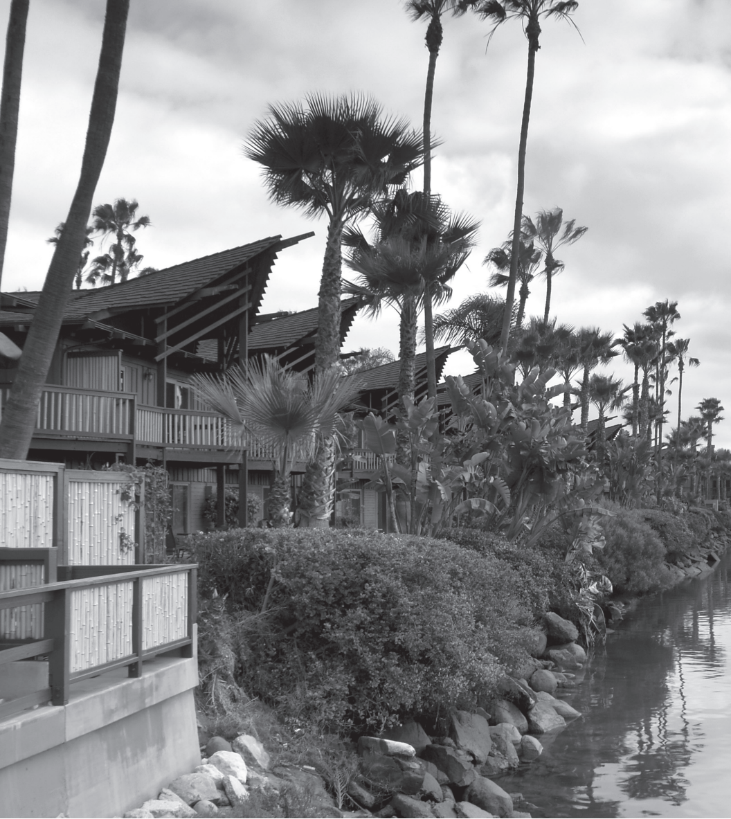
Half Moon Inn and San Diego Bay; next page Half Moon Inn porte-cochere, photos by Sandé Lollis

featured on sway-back roofs, projecting out over porte-cocheres, with plain or highly decorative corbelled wood pole or squared ridge beams or rafters. Sometimes the latter ended in decorative canoe-bow finials or extended like outriggers all the way to the ground into brick or rock planters. Close up features included exterior wood plank siding, natural stone, especially lava rock, and earth-colored concrete bricks.